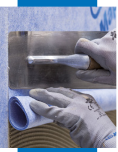
Application of the second sheet