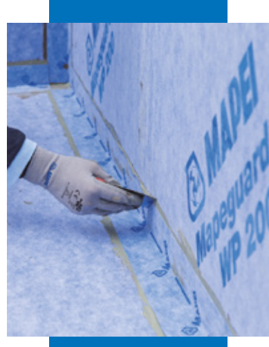
Application of Mapeguard ST

All relevant references for the product are available upon request and from www.mapei.com